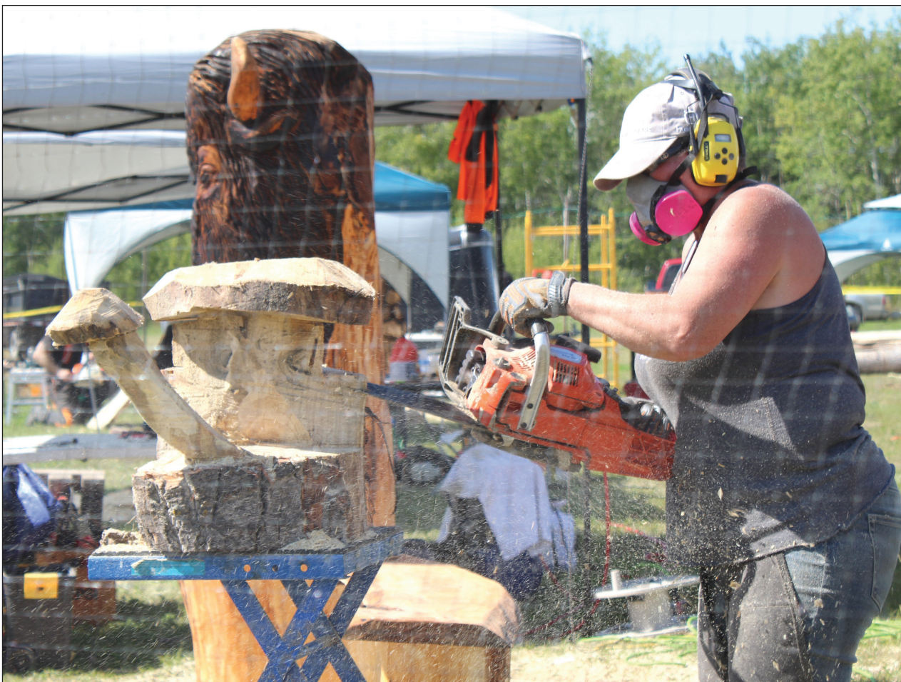
MB Chainsaw Carving Corporation

The 4P Golf Tournament will begin at 1 p.m. at the Pine