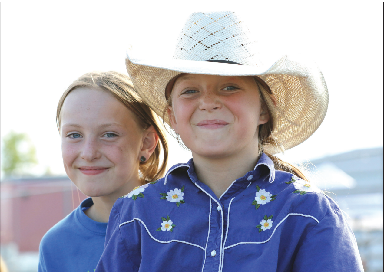
The Select Shows midway highlights children’s activities including a petting zoo and pony rides.